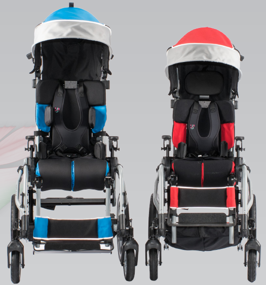
TRAK™ 14 TRAK™ 12